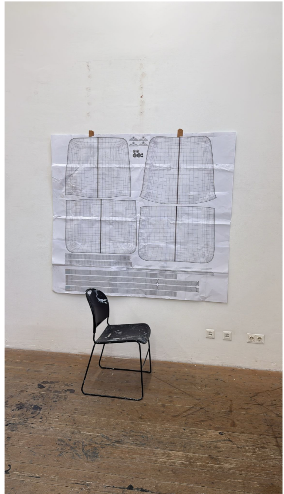
In-progress studio view, sculpture studio Kurzbauergasse, 09.02.2026.